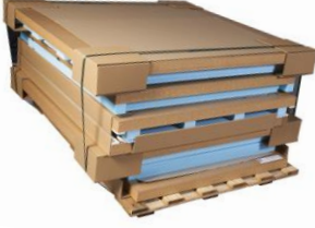
Quarter PMC External dimensions when flat-packed: 1545 x 1380 x 890 mm