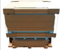
Quarter HPPS External dimensions when flat-packed: 1535 x 1275 x 1030 mm