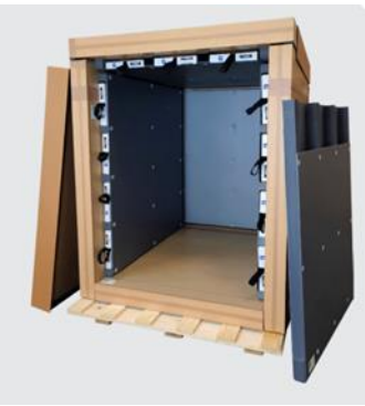
Non-contractual photo: the color of XPS may vary depending on the manufacturing site.